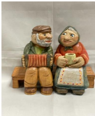
Old Couple by Tom Kissner